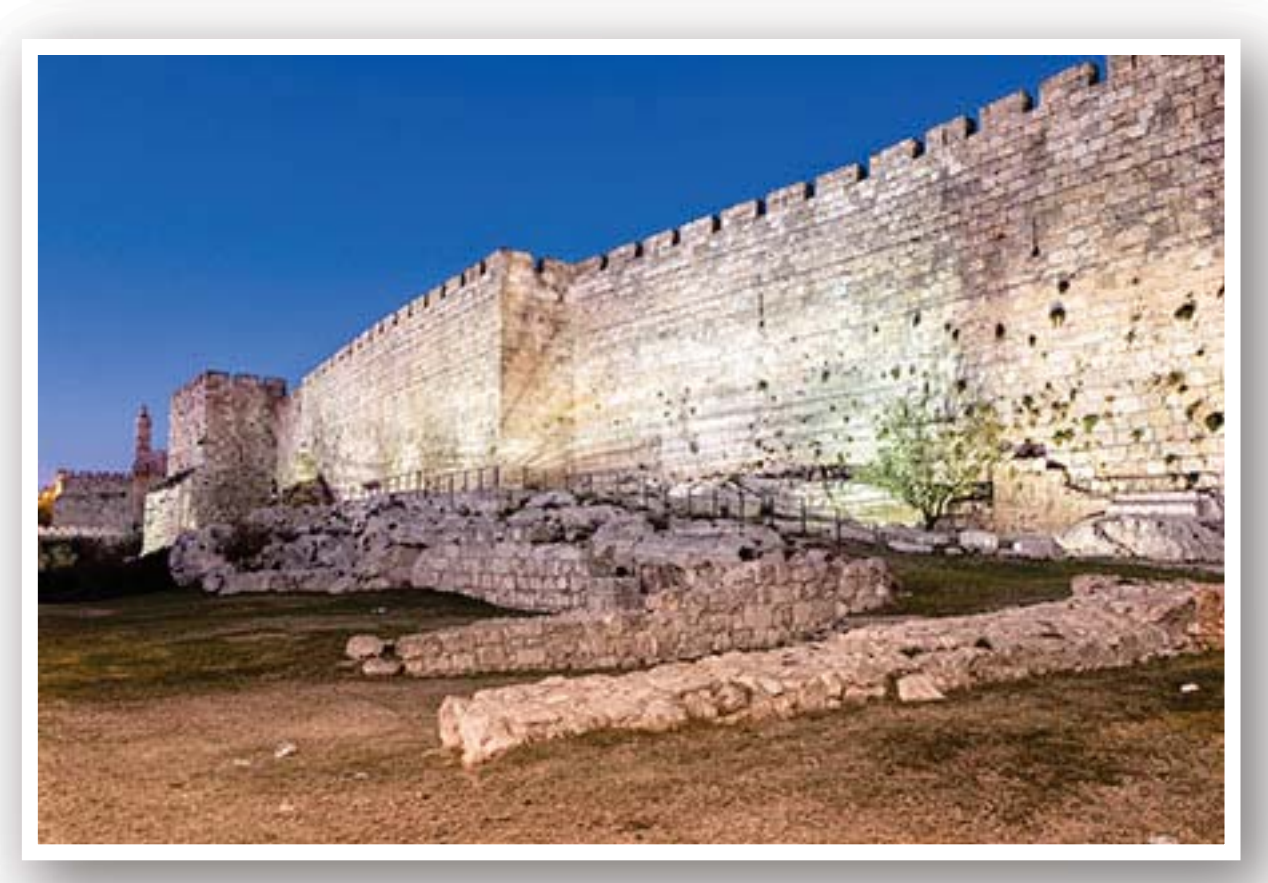
Jeruselem Walls at night