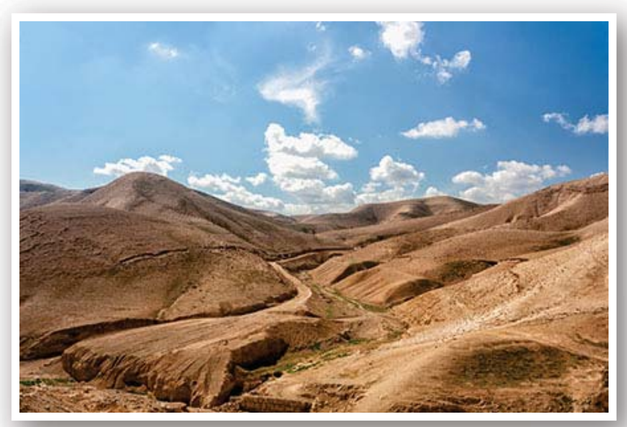
Judean Desert, the Holy Land