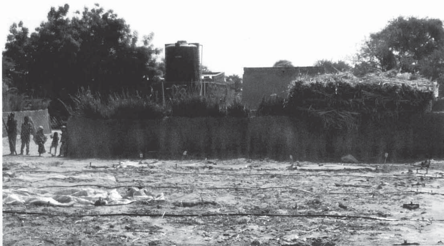
An irrigation system in Gangara waters both trees and vegetables

Support PC(USA) mission co-workers around the world: pcusa.org/donate/E132192