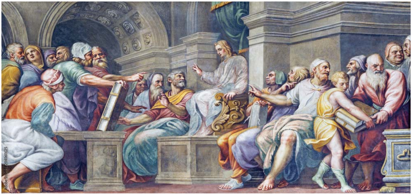
PARMA, ITALY - The fresco, Twelve year old Jesus in the Temple in Duomo by Lattanzio Gambara (1567 - 1573).