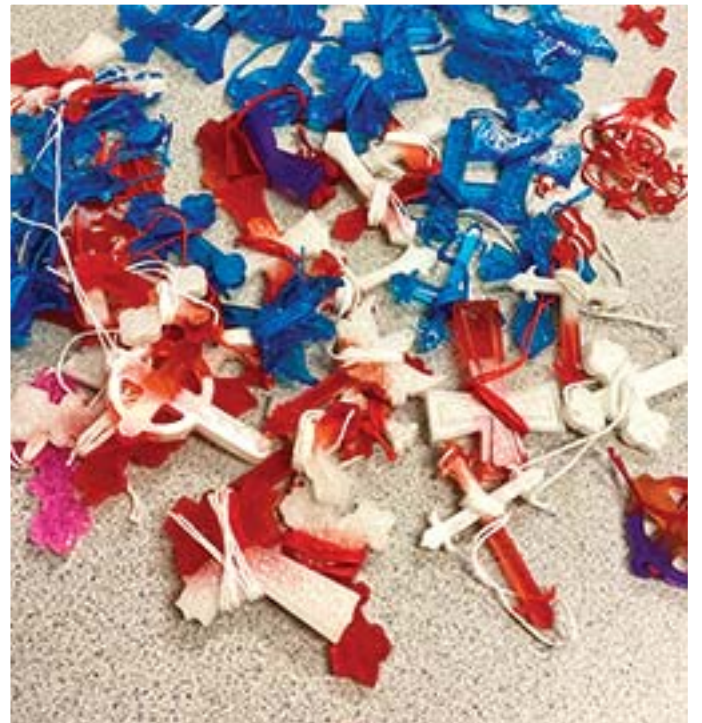
Anonymous note with crosses left at our front door last Sunday morning (August 20).